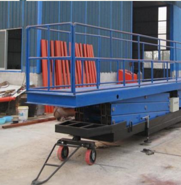
Single Scissor on Wheels